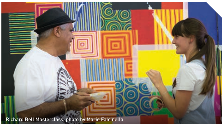
Richard Bell Masterclass

“Richard Bell has provided a unique voice for Aboriginal artists and I’m really grateful for the opportunity to learn from him.”