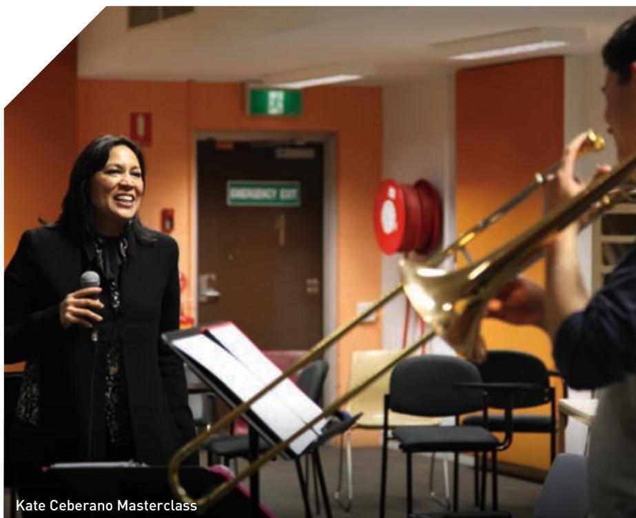
Kate Ceberano Masterclass