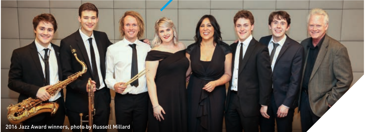
2016 Jazz Award winners

Each year the Helpmann Academy presents a number of awards to outstanding graduates and final year students from The University of Adelaide's Elder Conservatorium of Music. The awards are made possible through the generous support of private donors and corporate partners. The following musicians were awarded: