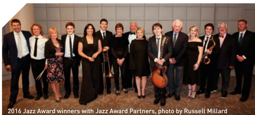
2016 Jazz Award winners with Jazz Award Partners