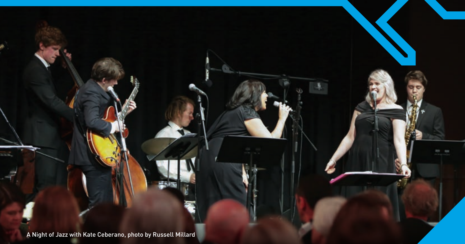
A Night of Jazz with Kate Ceberano