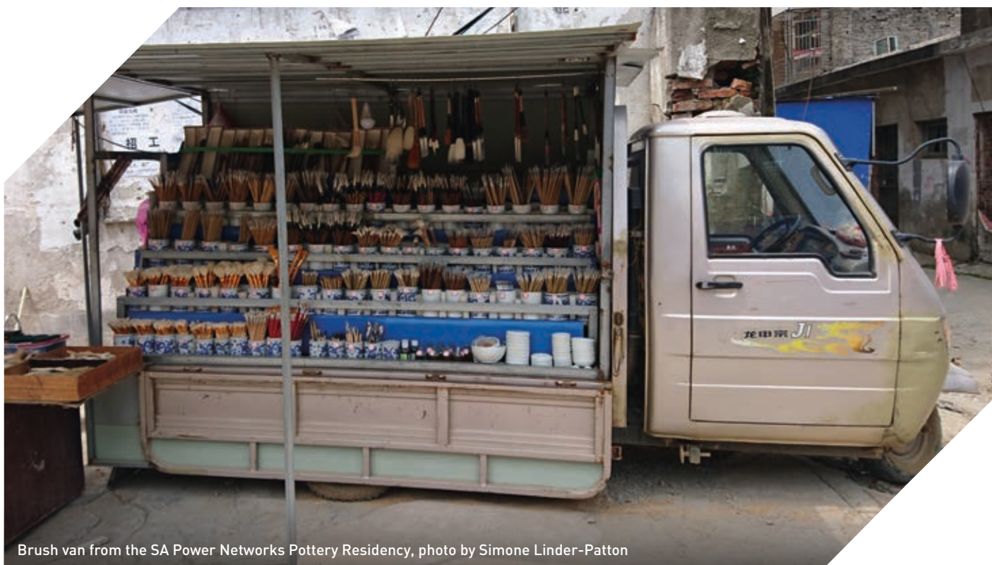
Brush van from the SA Power Networks Pottery Residency