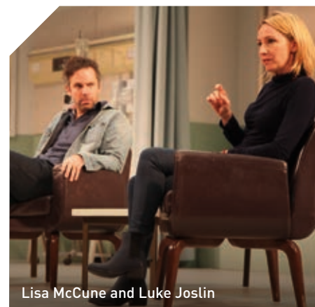
Lisa McCune and Luke Joslin